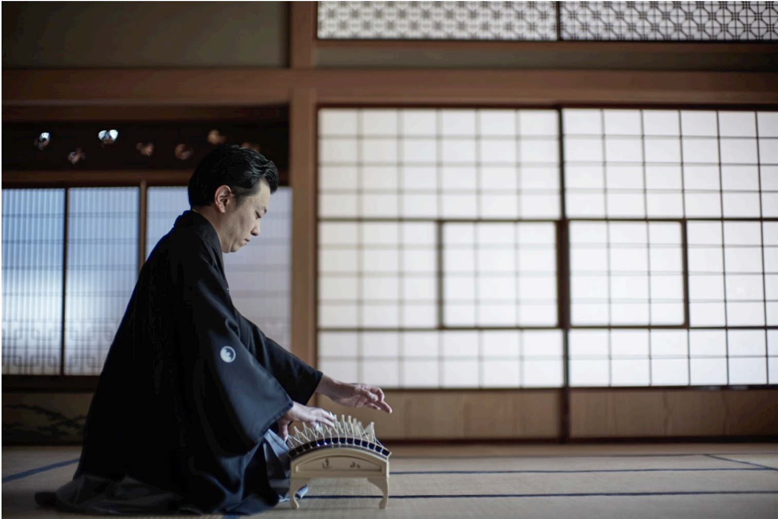
Seiha Hougaku kai; Utanoichi Okuda