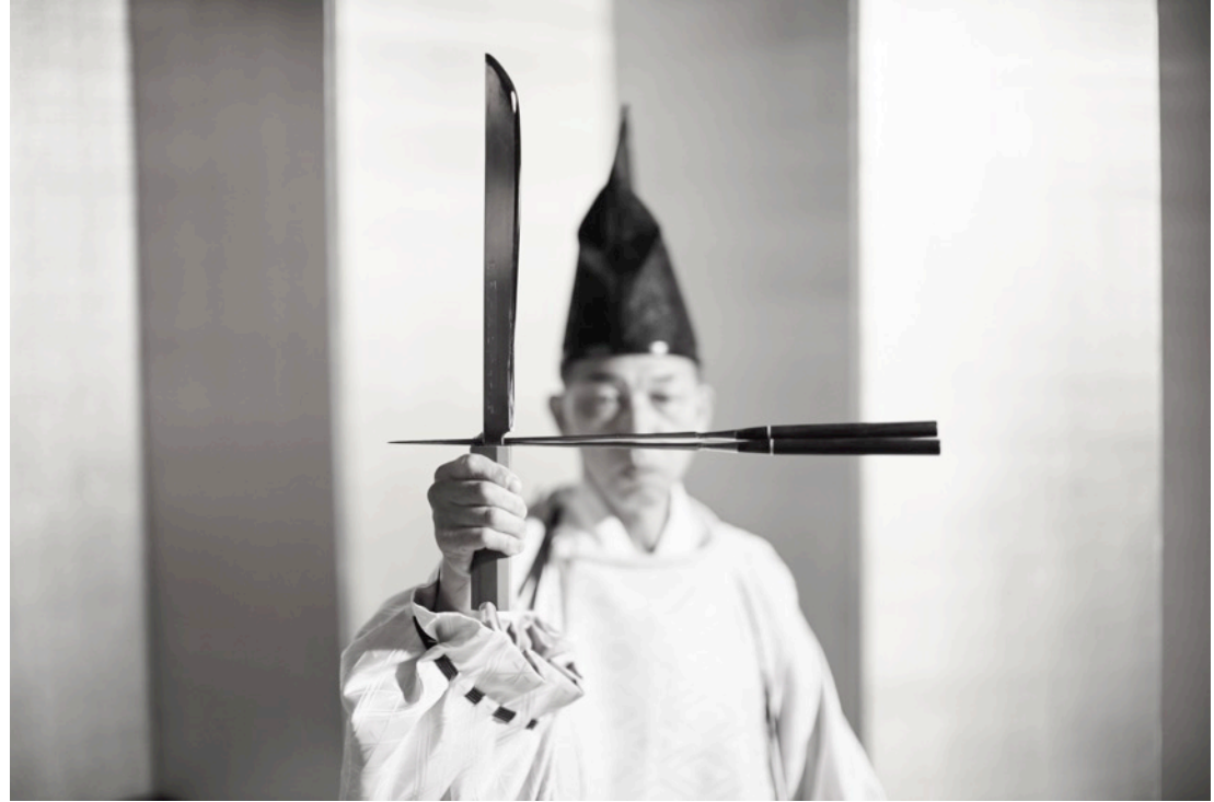
Ikama Shiki-bocho;Seiho Ikama