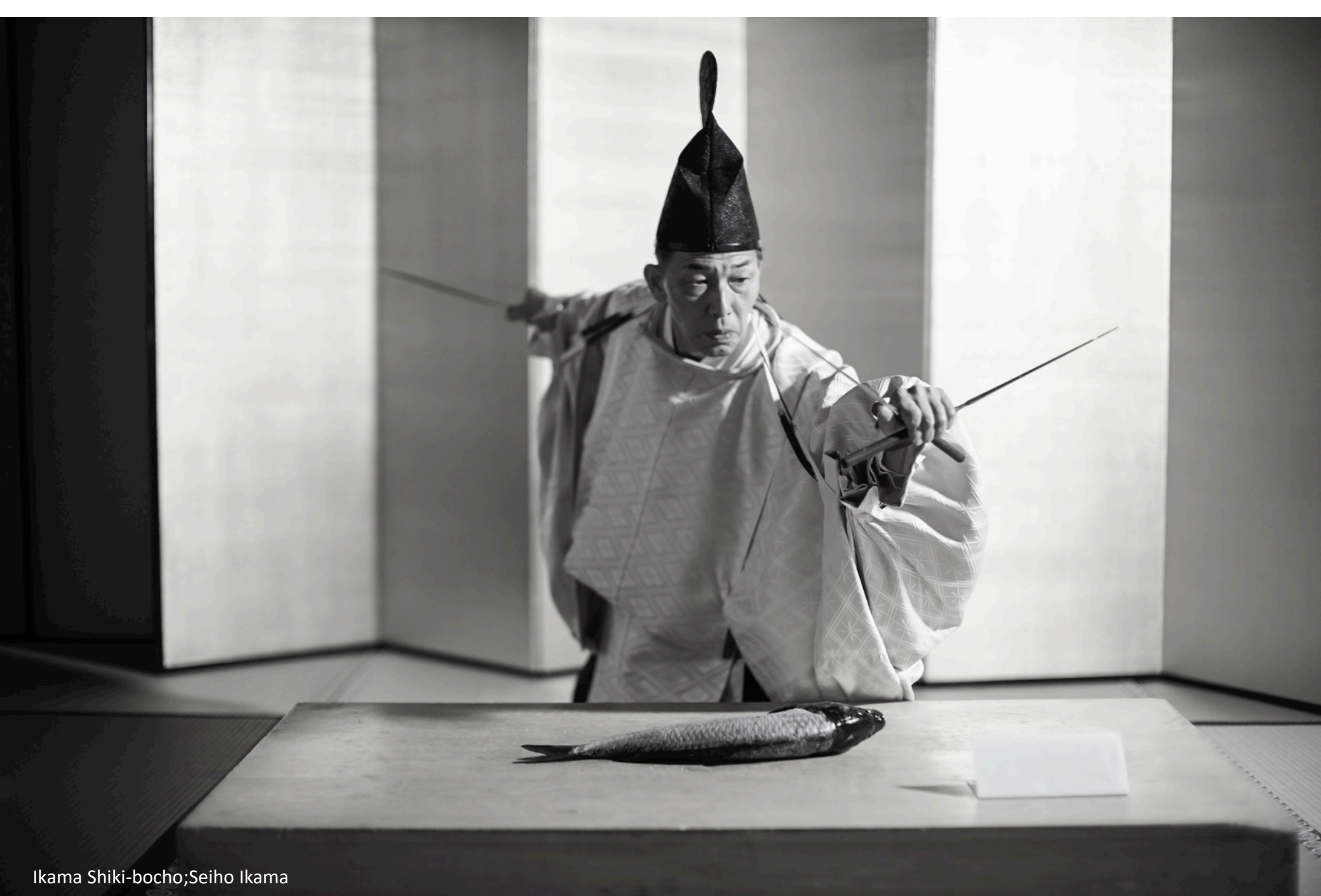
Ikama Shiki-bocho; Seiho Ikama