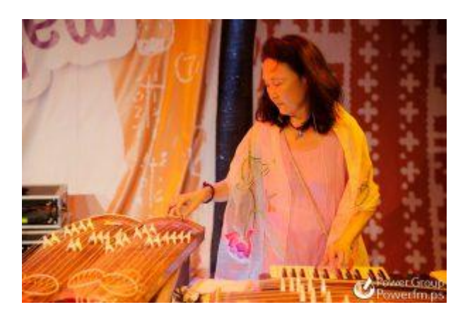
Mayu; Koto (Japanese Sitar), Synthesizer, Bass