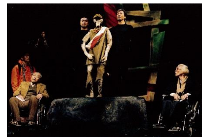
Leaders of the War

Performed places: Bucharest, Iasi (Romania), Chisinau (Moldova), Torino (Italy)