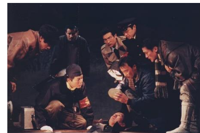
Kuro-Nenbutsu Murder Case

Performed places: Sibiu, Bucharest, Constanta (Romania), Chisinau (Moldova)