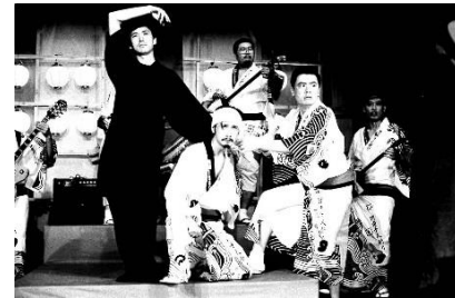
Enigma of the 10 dead in Kawachi

The title, "Nazotoki Kawachi Junin Giri" (Enigma of the 10 dead in Kawachi), is build with the plot of smoking out the ordinary people's rebellion against the government power, hidden in the Kawachi area's folk song. The show was also performed in two cities of Ramnicu Valcea and Alba Iulia. For of the performance on stage of live Japanese folk music, its uncommonness and curiousness, and showing the dark side of Japan's modernization, the performance earned enthusiastic applause.