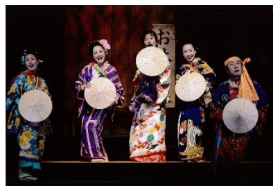
Shiranami Gonin Onnna

Performed place: Chisinau (Moldova), Bacau, Bucharest (Romania)