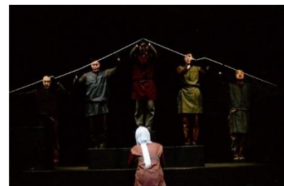
Ah, Tokyo March

Performed places: Manaus, Belem, Tome Acu, Brasilia, Guatapara, Sao Paulo, Ibiuna/ Comunidade Yuba, Rio de Janeiro (Brazil), Yguazu (Paraguay)