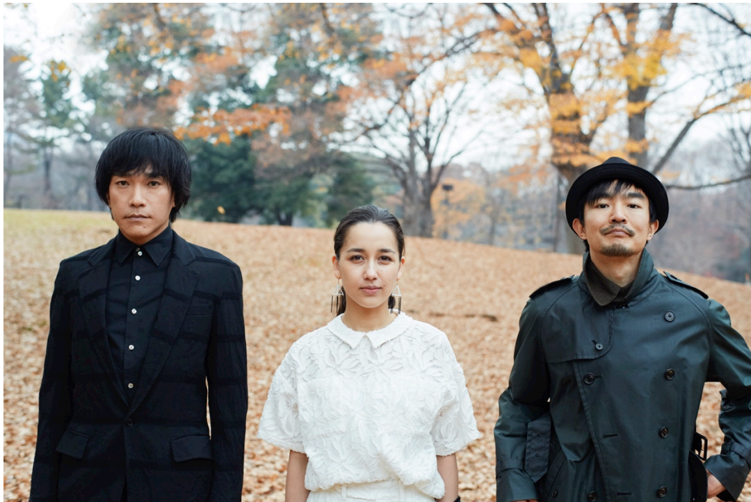
野田孝之輔 Konosuke Noda Actor