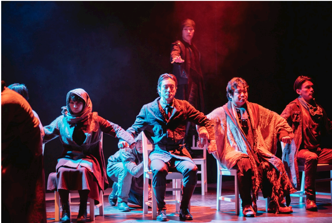
音楽劇『赤い竜と土の旅人』より @すみだパークスタジオ倉 (2016年3月)

In 2014, we are chosen by National Theatre Wales's R & D project "Waleslab", and researched about the red dragon myth of Wales and New nuclear unit in North Wales which would be built by Japanese company. We brought back the idea of new musical about humanity and Nuclear Power, created a new musical "Red Dragon and Soil Traveller" in 2016, and got Silver Grand Prix and Production Award of Corich Performing Arts Festival 2016.