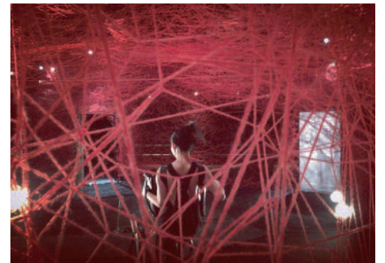
in "The Rocked Room" installation by Chiharu Shiota 2016