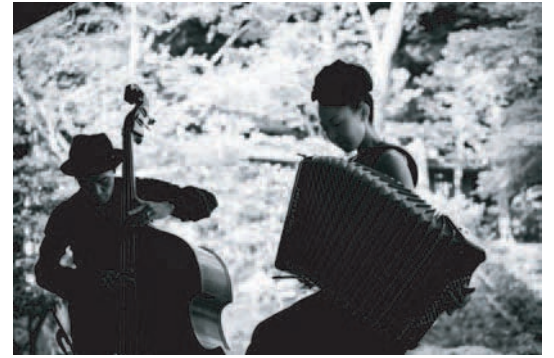
at Honen-in Temple 2015