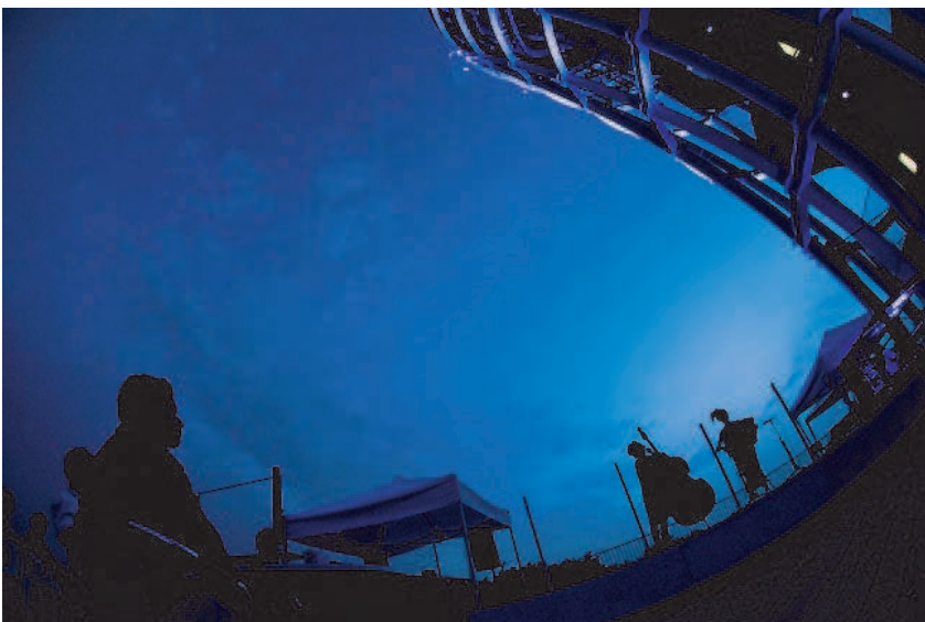
on the top of Enoshima-iland 2017