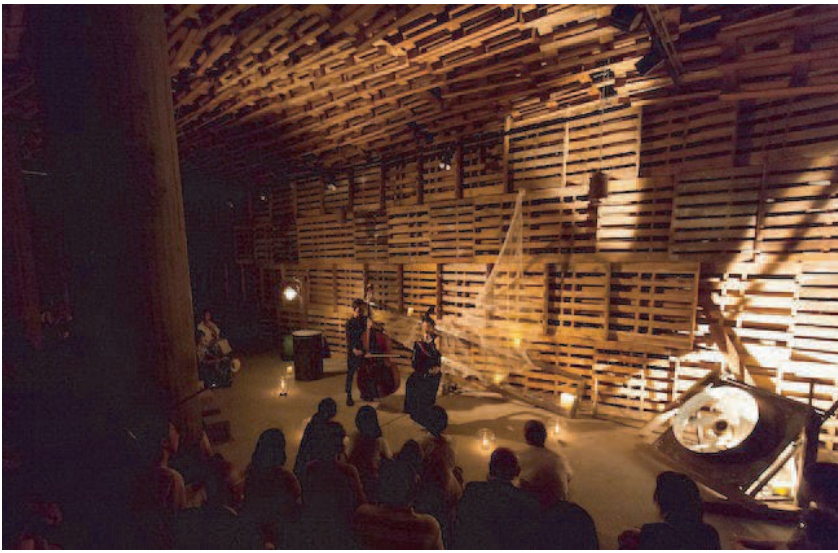
at Hall by Tadashi Kawamata 2017