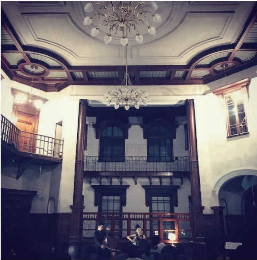
at Iwate Bank * Important Cultural Property 2017