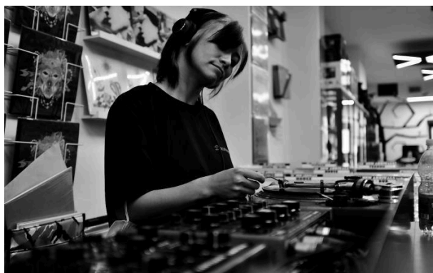
DJ set at Serendeepity Milan

https://tamburineri.bandcamp.com/album/ombre