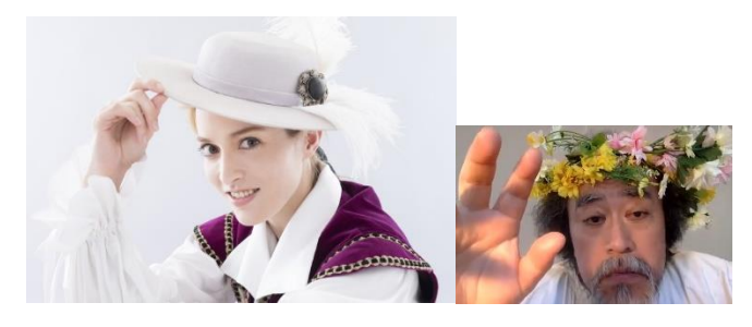
In 2020, Reading performance of King Lear, translated and directed by Kawai