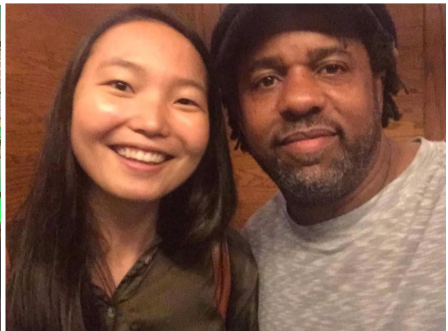
Performing with Victor Wooten in Kenya as SkyBridge