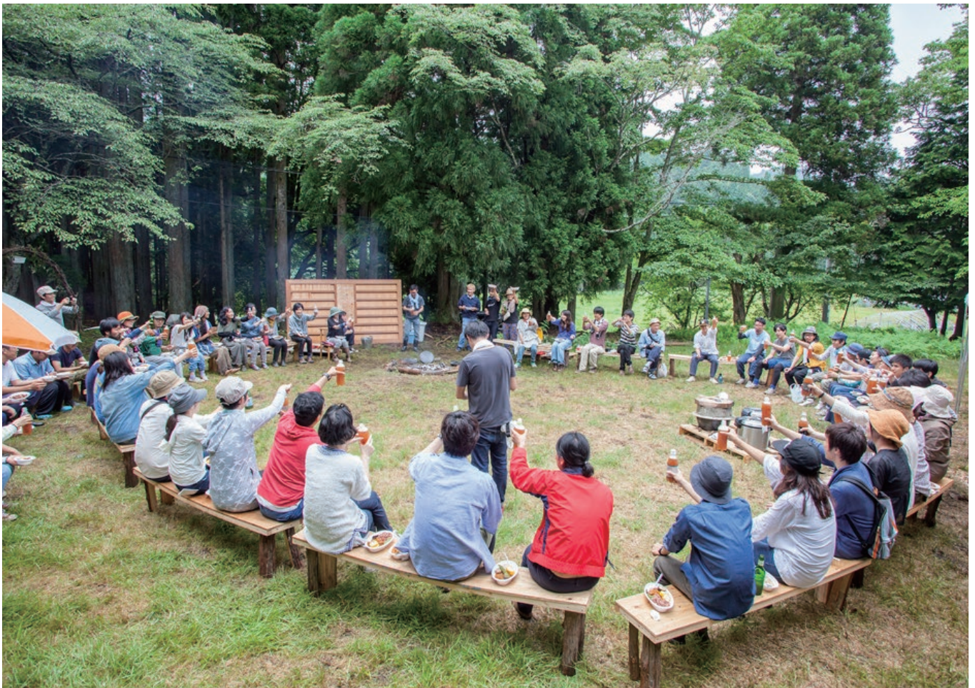
DESIGN EAST04_CAMP in KYOTO / 2014