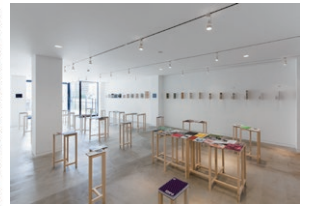
Exhibition View in Osaka