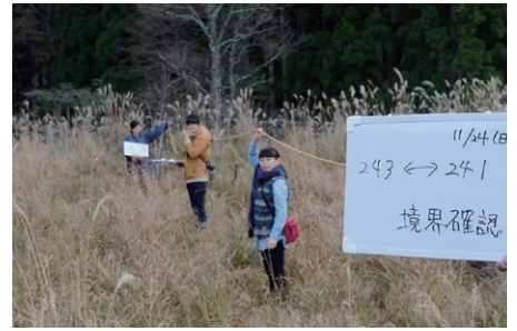
Survey of site boundary