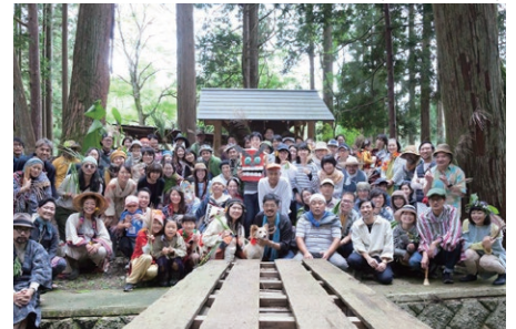
Revived village festivals