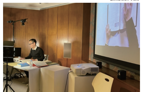
Public event "Playback Archives"