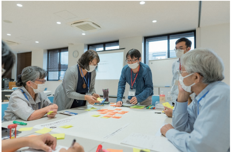
Workshop with local residents