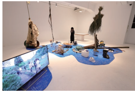
Exhibition View @ Kyoto Art Centre / 2019