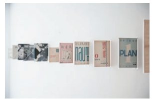
Japanese archizines added at the Japan Exhibition