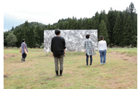
Exhibition [Soshi Matsunobe] Twisted Nature / 2020