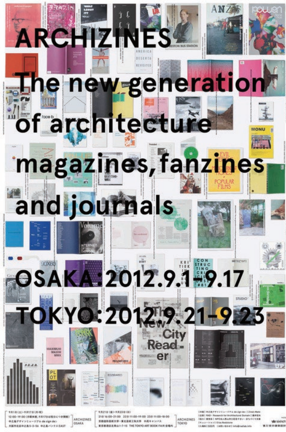
Poster ( original design in Japan)

The original exhibition with its synchronicity and the Japan-specific exhibition with its diachronicity showed the expansion of architectural magazines. In addition, several architects were asked to create a new 'Architectzine'. It was exhibited and sold.