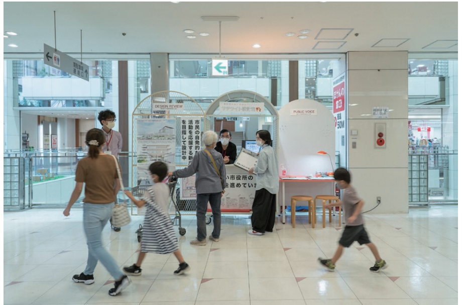
Satellite workshops in shopping malls