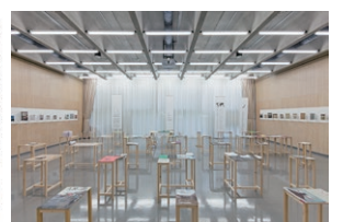
Exhibition View in Osaka