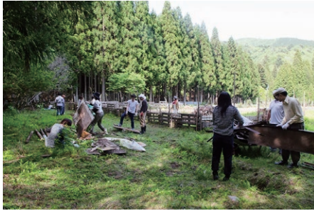
Cleaning up illegally dumped garbage

So up to now, the project has organised environmental improvements such as cleaning up illegally dumped rubbish, workshops on renovating old houses, hands-on workshops using the nature of the satoyama, open-air exhibitions and performance events.