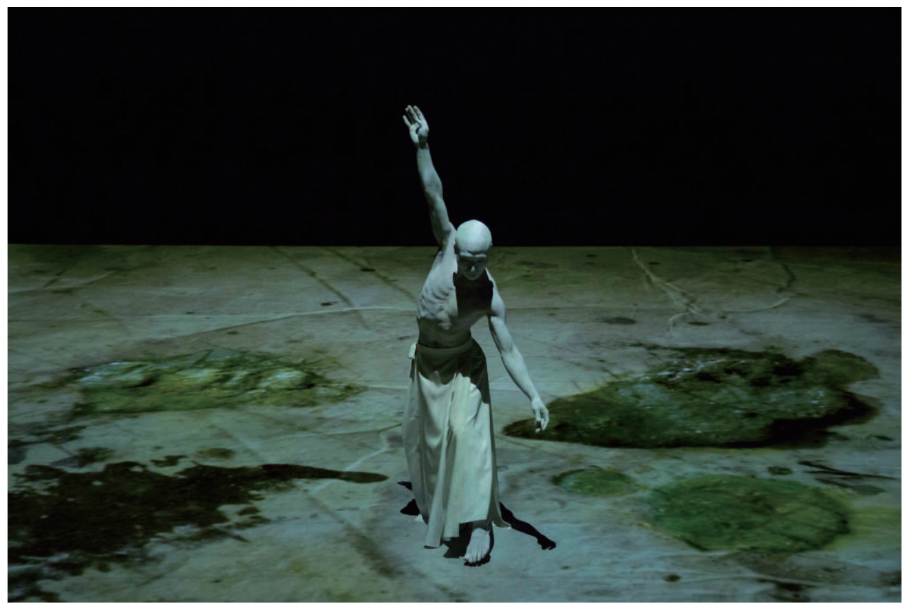
Solo performance at KAAT EXHIBITION 2017