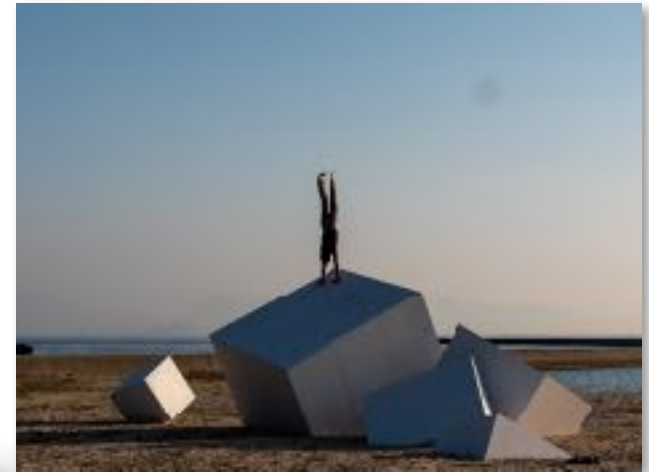
「FLOE」 Supported by Japanese Ministry of Culture / Institut Français Paris / Rennes Métropole / Spectacle Vivant en Bretagne