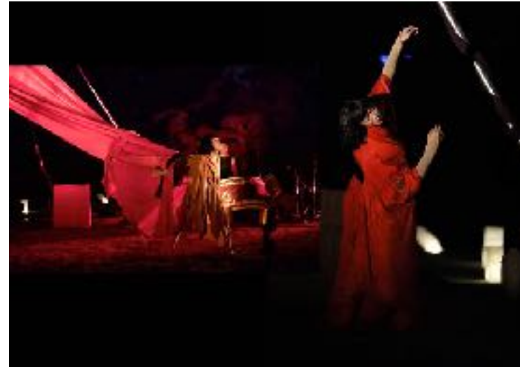
「Nouveau Cirque Japon」