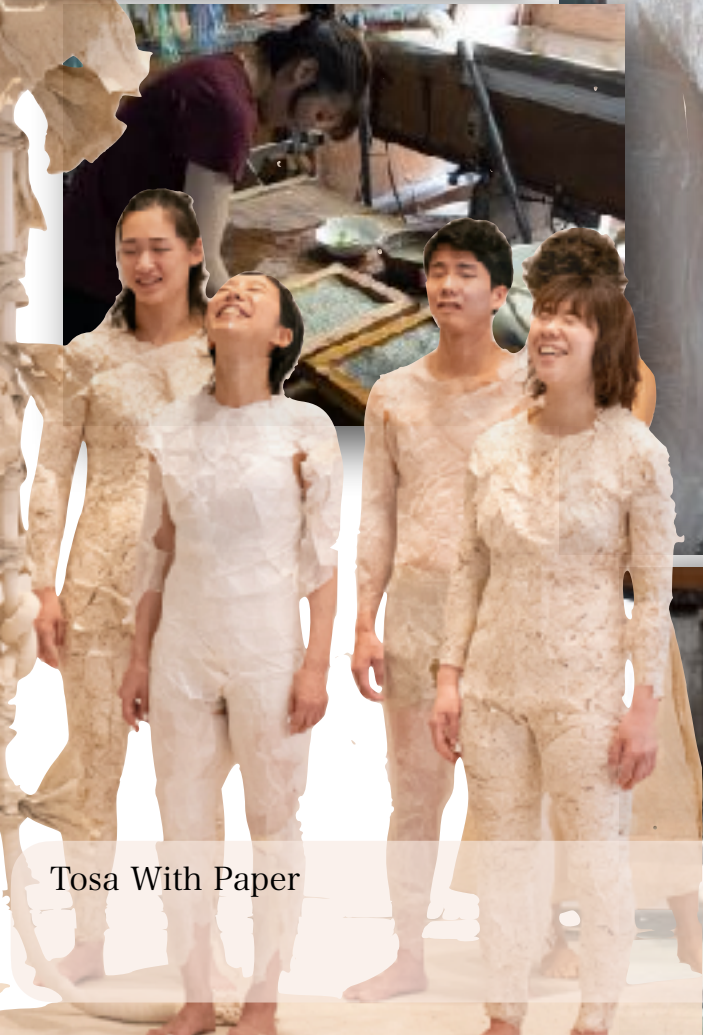
Tosa With Paper