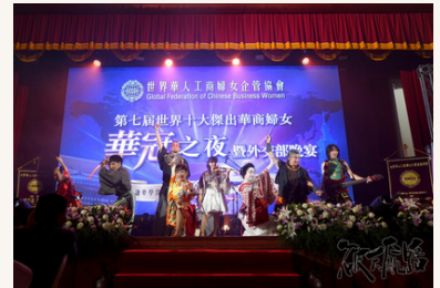
2018 Taipei Grand Hotel (Taiwan)