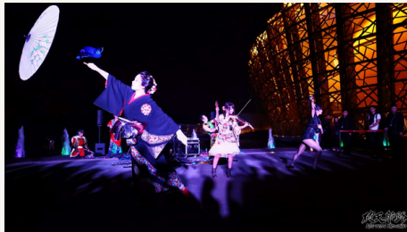
2019 Wuzhen Theatre Festival (China)