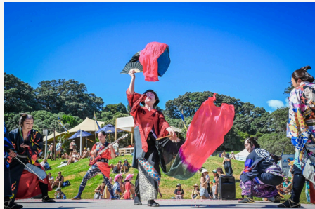
2024 SPLORE Festival (New Zealand)