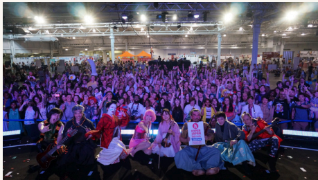
2018 HYPER JAPAN (London)

Numerous other performances in UK, France, China, Taiwan, New Zealand, and more