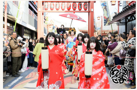
2025 The ASAKUSA SHOW PARADE