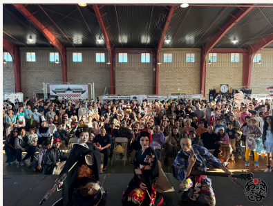
2025 OC Japan Fair (NC,US)